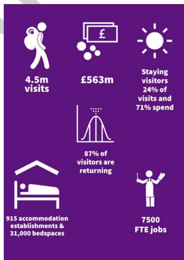
Figure 1: The English Riviera Visitor Economy 2019

Covid-19 has undeniably had a devastating impact on the resort. Despite this, the sector has remained resilient with positive results from summer 2021 and achieving accolades such as TripAdvisor's 2021 Number 1 Staycation Destination. There has also been continued investment in products and businesses across the destination.